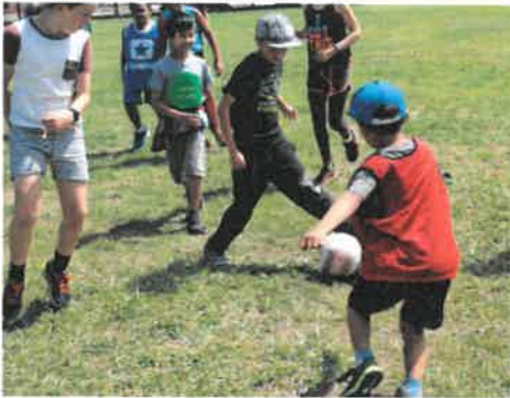
Here are some photos of some of the activities from Golden Time last week.

Our team pick activities they know the children will enjoy. The children get to choose the activity they most want to do. We find that the children also enjoy getting to interact with children from other classes, being in other spaces as well as spending time with other teachers.