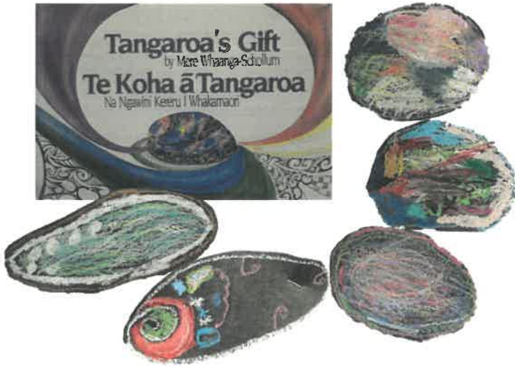
Art work by some children in Waka Rimu Toru.