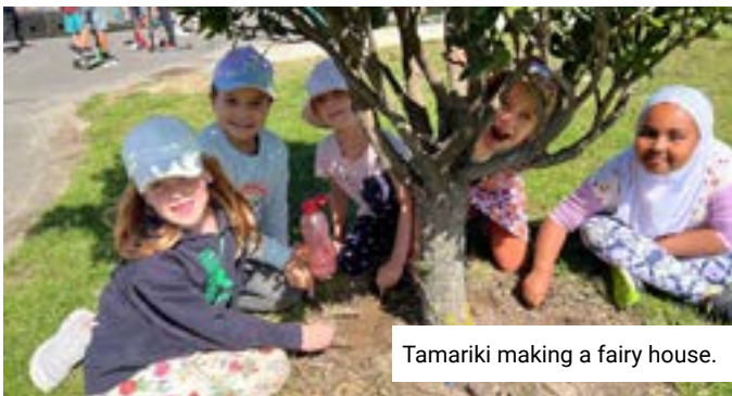
Tamariki making a fairy house.