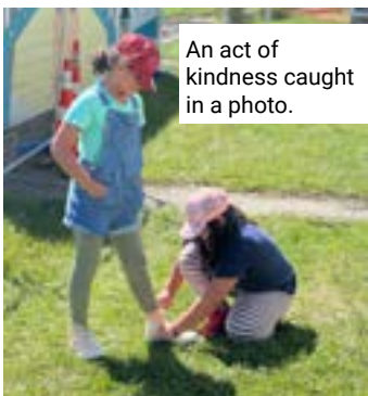
An act of kindness caught in a photo.