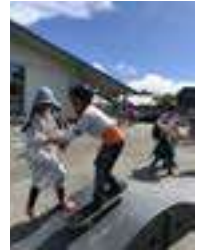
We absolutely love it when we see our tamariki helping one another!