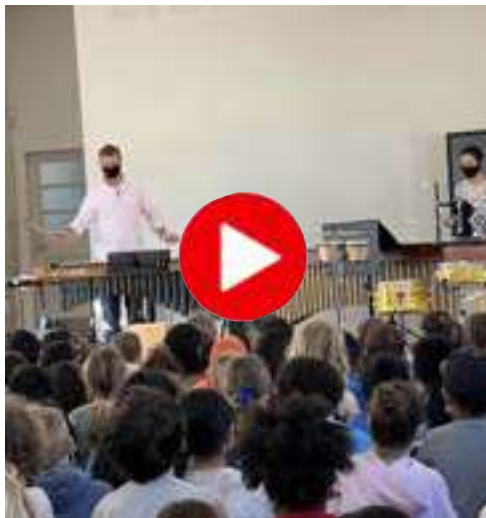
If you're viewing this newsletter online press play to get a taste of our experience with Orchestra Wellington's Music to Schools programme.

Walking through classes it is easy to see evidence of the quality learning going on. Now that Covid restrictions are not so tight I encourage you to pop into your child's class and check out the displays or take a moment to flick through your child's books so you can see their work. Although I always try to share in the newsletter the learning going on, it really doesn't come close to capturing all we do. If you do make it in you're more likely to come across the results of your child's learning.