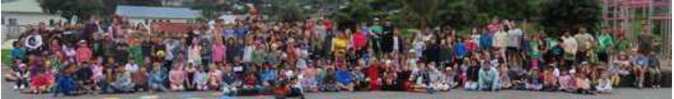
Whole school photo, 3 March 2023