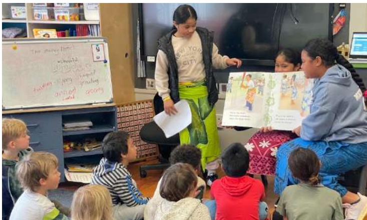
Some of our older students shared a special moment with our tamariki, reading a beautiful story aloud in their own language.